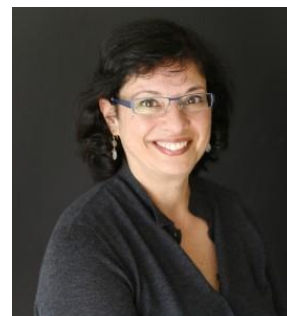
Keynote Speaker: Sonia Nazario

sjourney.com/ To learn more about submitting a proposal, click here. The extended application deadline is August 1 st .