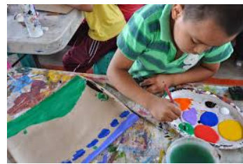
Art and identity project