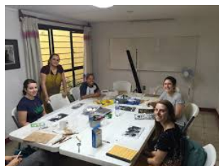
Spanish and culture class